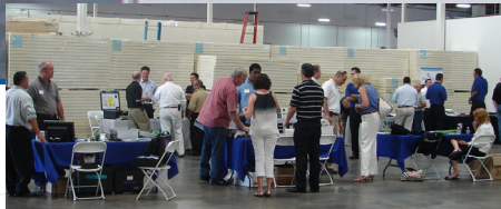
The Crown Technical Systems Open House Celebration Event in August 2010

Crown Technical Systems is a California corporation based in the Inland Empire city of Fontana. Since being founded in 1996, Crown Technical Systems has enjoyed a modest and sustained growth and has reached a capacity requiring the move to a new facility this last spring. This new ninety two thousand square foot facility on six acres will continue to enable us to provide quality products and services to the U.S Government, publicly and privately owned utilities, general contractors and other corporations.